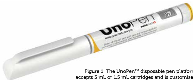
Figure 1: The UnoPen™ disposable pen platform accepts 3 mL or 1.5 mL cartridges and is customised for use with insulin, GLP-1, hGH, FSH and PTH.