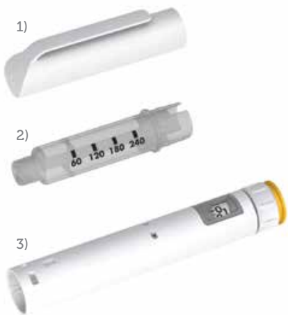
Figure 2: UnoPen™ is delivered for final assembly in three different subassemblies: (1) pen cap, (2) cartridge holder and (3) dose mechanism.

level taking into account a broad range of patient populations and disease states. This underpins design input for further human factor studies performed on the final custom product.