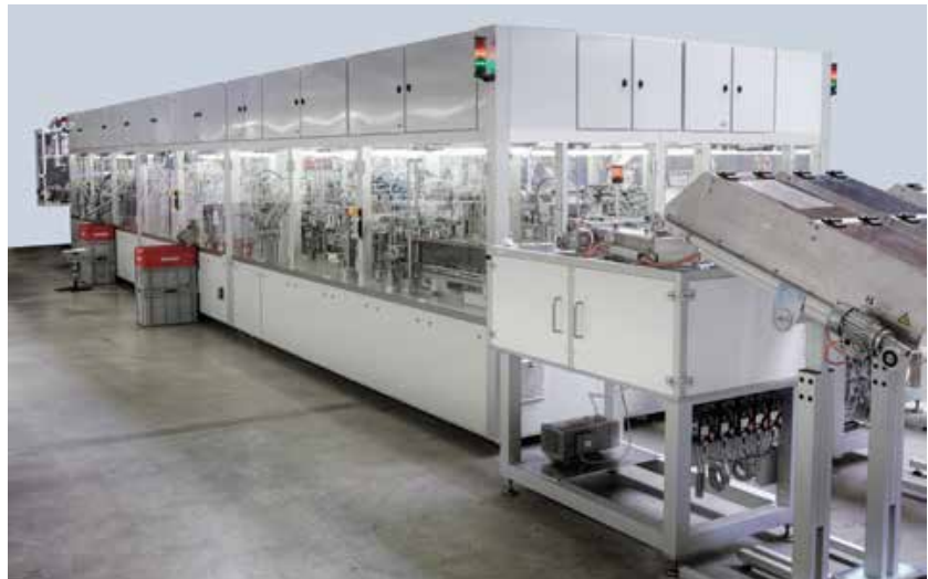
Figure 3: The UnoPen™ manufacturing line.

Ultimately, one of the most important factors is to install manufacturing capacity for the new platform to allow customers to access the platform easily at a fraction of the