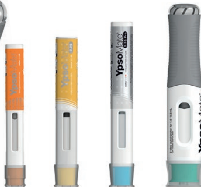
Figure 2: The YpsoMate autoinjector family.

force profiles allow the system to be adapted to accommodate a broad range of drug viscosities, up to 30–50 cP. Furthermore, it allows the adjustment of the flow rate to the desired target value. Configurable injection times are in the range of approximately 10–60 s for an injection volume of 5 mL.