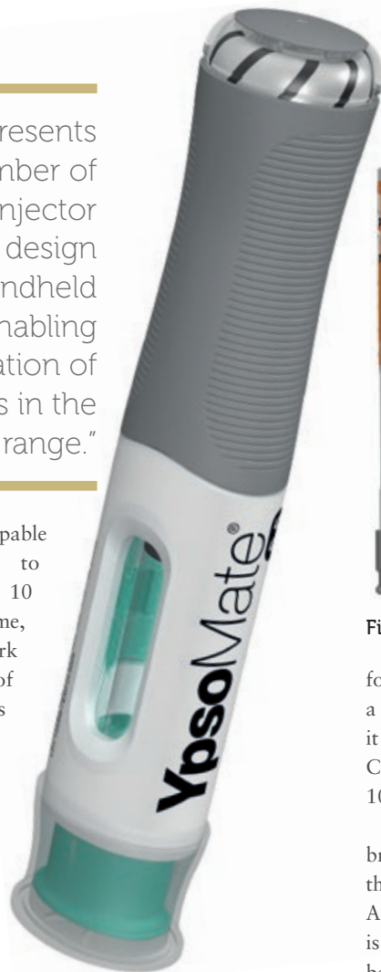
Figure 1: The new YpsoMate 5.5 large-volume autoinjector.

Today’s autoinjectors are capable of injecting volumes of up to approximately 2 mL in around 10 seconds, which are medium-volume, high-rate injections. Recent work on increasing the volumes of autoinjector-based injections has been published in preclinical and clinical studies that explore the new field of large-volume, high-rate injections. 2–6 The results of these studies indicate that high-rate injections of volumes beyond 2 mL are feasible, paving the way for the development of autoinjectors for volumes above 2 mL.